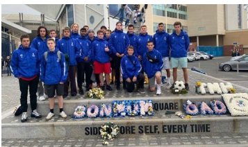
"UK tour boys at Leeds Stadium enjoying our time over here".

The boys' left on Sunday for a once in a lifetime opportunity visiting famous Football stadiums and playing against local school football teams and sightseeing.